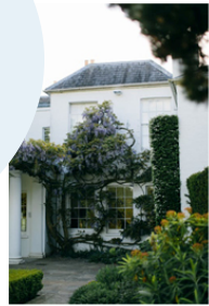
Why would you finance a fine

Publish internal articles focussing on the customer/advisor